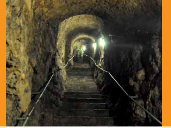
Pétrusse Casemates: Austrian staircase

Due to these impressive bastions, the city of Luxembourg was deservedly called the "Gibraltar of the North". In 1867, the fortress was evacuated and had to be dismantled following the neutralisation of Luxembourg. The dismantling lasted 16 years and the casemates were reduced to 17 km. Because of its underground location in the city,